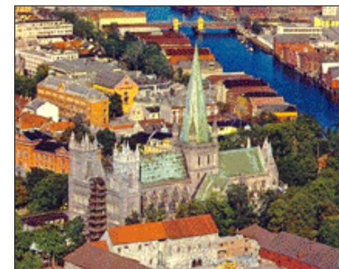
The symbol of the Trønderlag is the Nidaros Cathedral in Trondheim.

The 2014 tour celebrated the 200th Anniversary of the signing of the Norwegian Constitution. Members of the group joined with the Syttende Mai adult parade in Trondheim on May 17 and participated in a special service at Nidaros Cathedral. Future tours will be planned.